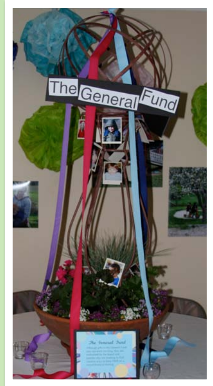
A table display from the 2010 auction

This is the big one, folks! We count on our largest fundraiser of the year to bring the money that we need to make our budget. This year our operating and scholarship needs are high, and we need 100% participation to create a successful and fun evening. So let's all roll up our sleeves and show this island a great time!