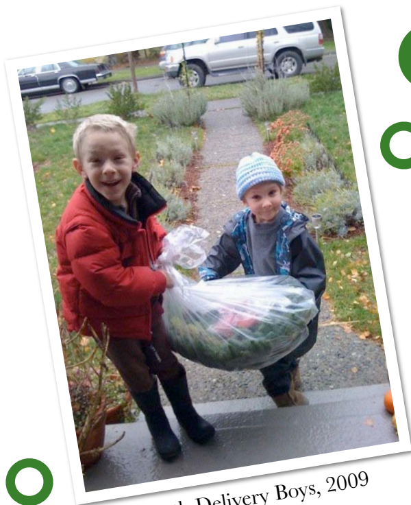
Wreath Delivery Boys, 2009