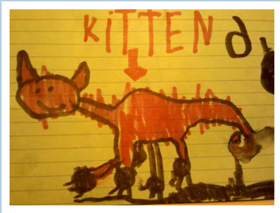
"Kitten" by Moose

Attention to these details will make your child's experience at school more enjoyable: